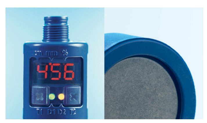
TouchControl with LED display - Wear-resistant PEEK protective film

The protective film is also highly resistant to corrosive media. The threaded sleeve is made of 1.4571 stainless steel.